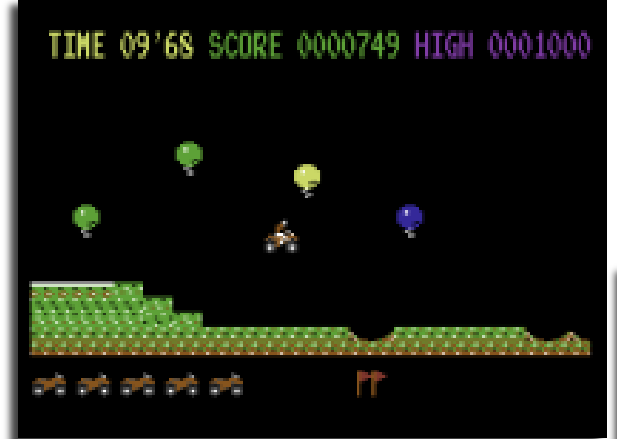
INVASIVE ACTION by Backward Engineering

The first release came in two forms – the limited edition, in a large red plastic case, and the more standard cardboard box as used on the other games. I was one of the first to order, so I got hold of the limited edition. In case you were unaware, this is actually a radically different game to the split-screen racing action of the C64 Kik Start games. Instead, it is based on an old arcade game where the player has to jump obstacles and collect balloons. It's a great game on the C16, and the conversion does it justice with added music and retaining the original's playability.